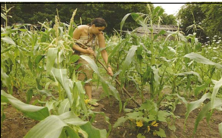
A Wampanoag cornfield with a Wetu (house) at the back at Plimoth Plantation. Beans and squashes are also planted with the corn and the three are called "Three Sisters."