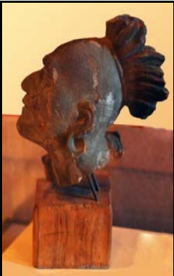
Squanto Bust

At http://www.plimoth.org we find the following account by the Wampanoags, "Around 1,000 years ago, the elders tell us, our relative the Crow flew from the Southwest to the Wampanoag Nation, bringing us the first corn and bean seeds (weachamin gka tuppquam wskan-nemuneash) as a gift from the Creator. Since that time we have learned from our grandmothers and grandfathers how to sow, tend and harvest these wonderful plants."