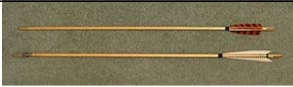
Traditional target arrow (top) and replica medieval arrow.